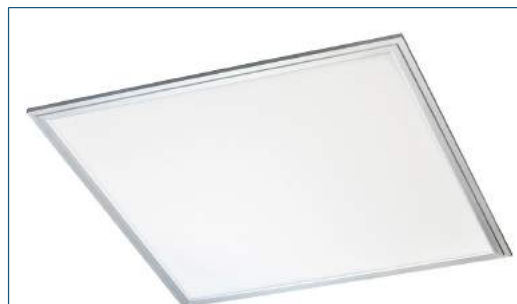
2x2 LED Flat Panel